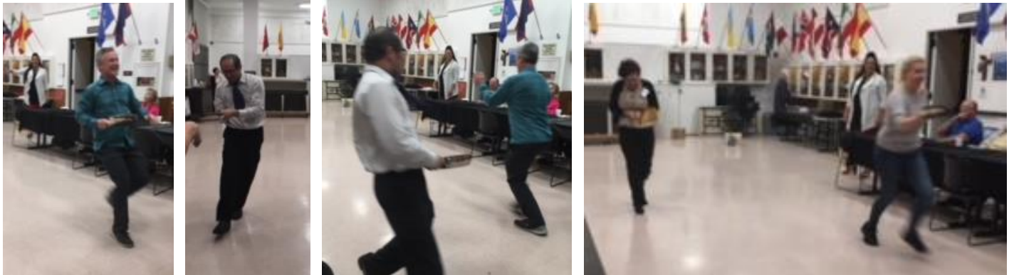
Great fun- pancake tossing races!