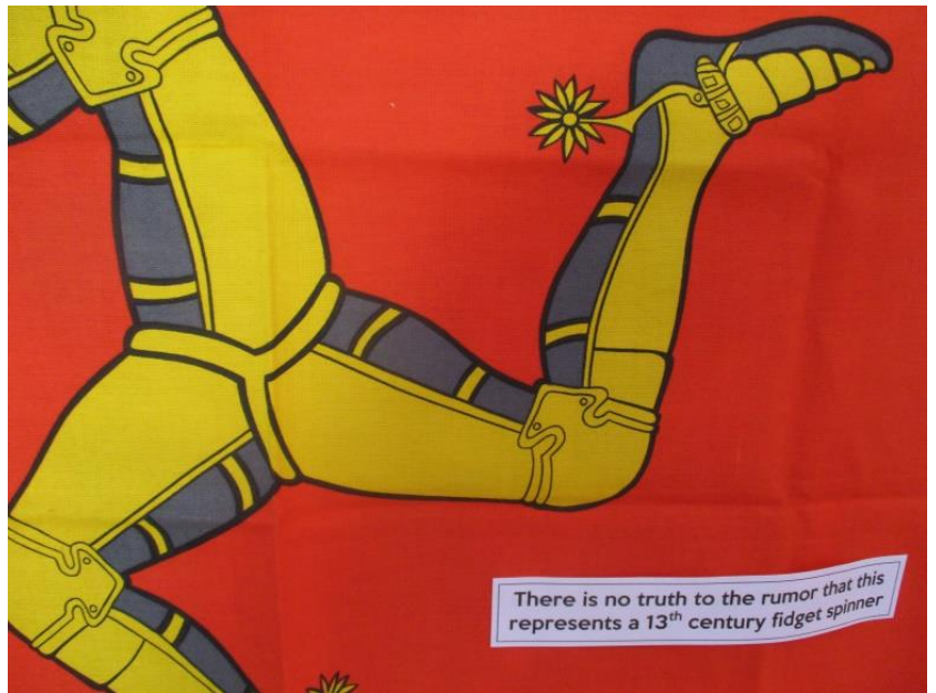
Dennis' sense of humour strikes again!