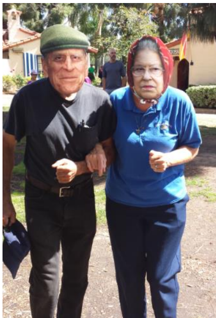
Perhaps HRH and Prince Philip will come incognito to the lawn program again this year?!?!?