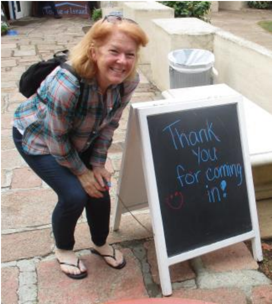
Friend of Beryl improved our greeting boards!