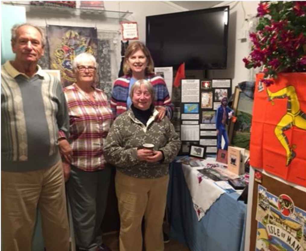
San Diego MANX group would love to have you join them